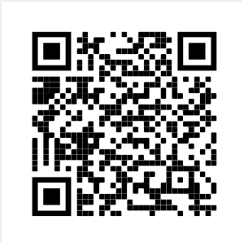
Watch the recording of CURE Epilepsy’s Purple Day® presentation.