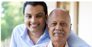
AGING AND EPILEPSY: CONSEQUENCES AND COMORBIDITIES TO CONSIDER IN OLDER INDIVIDUALS