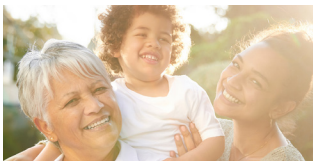
WOMEN’S HEALTH: COMPLEX INTERACTIONS OF EPILEPSY, MEDICATIONS, AND HORMONES

Epilepsy affects groups of people in different ways, from women and siblings to older adults. CURE Epilepsy’s webinars provide education and information to empower people with epilepsy and their loved ones.