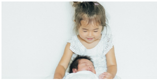
SIBLINGS AND SEVERE CHILDHOOD EPILEPSY: THE IMPACT OF SEIZURES ON THE FAMILY’S MENTAL HEALTH